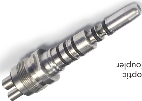
The Midmark Fiber-optic Highspeed Swivel Coupler